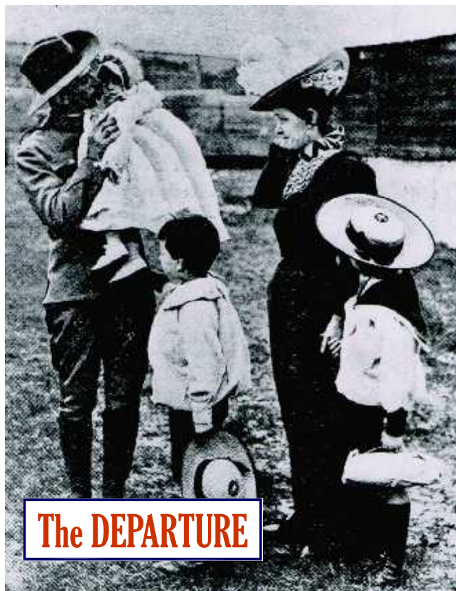
"Saying Goodbye" - The Departure of the NSW Troops for South Africa, 28th Oct 1899 (Images from the 'Sydney Mail')

During the Boer War, news updates were posted on banners hung outside the offices of 'The Herald' in Hunter Street.